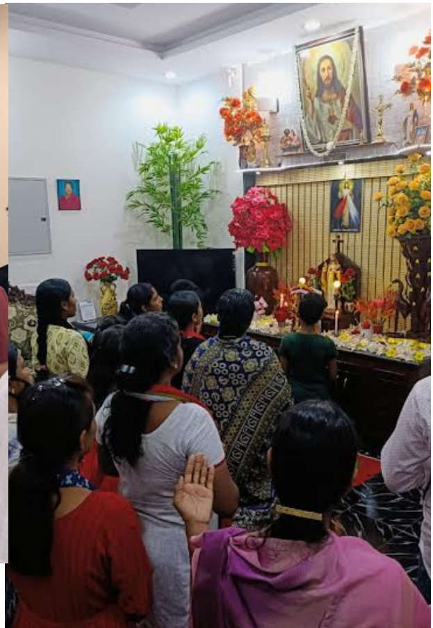
Sweet moments, photos taken from KCS whatsapp group