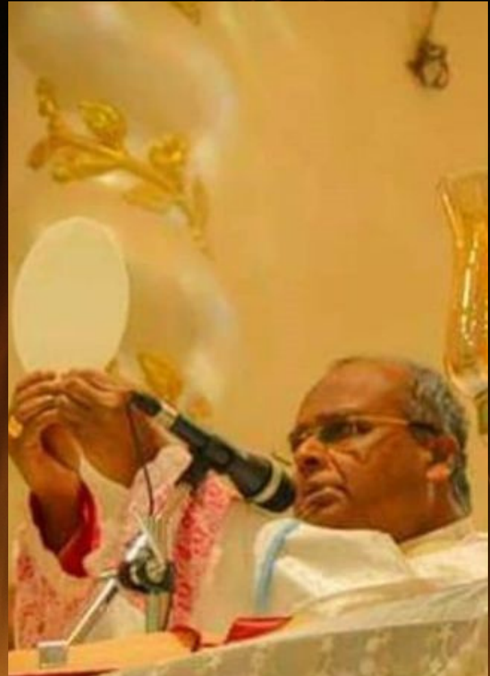
HOLY MASS ON APRIL 2, 2022, SATURDAY, 4.30 PM AT SANTHOMÉ CATHEDRAL