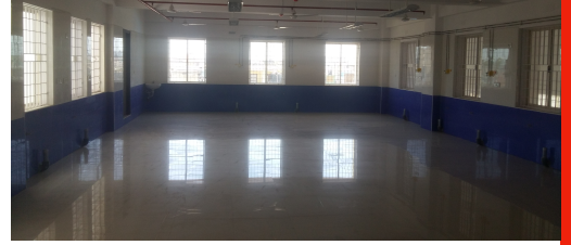
Place provided by Chennai Corporation for dialysis unit in Padi

KCS has taken the dialysis project in collaboration with Rotary Club, Tanker Foundation and Chennai Corporation. As informed earlier, Chennai Corporation is giving the place for putting up a 12 bedded dialysis unit in their Primary Health Centre, Padi, Ambattur, Chennai. All infrastructures like 12 dialysis machines, beds, RO plant, air conditioners, lighting, fans, table & chairs for nursing staff & Doctor, etc at an estimated cost of Rs.1.30 crores will be shared equally between KCS and Rotary on 50:50 basis.